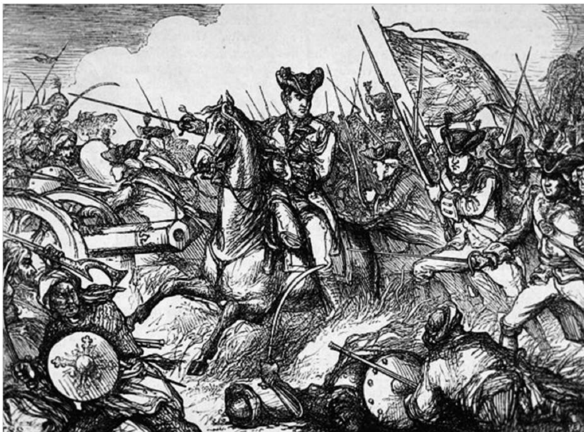
An eighteenth-century British print of the Battle of Palashi (Plassey)

During the war with France, which broke out in 1756, the British used internal divisions in Bengal to their advantage. They weakened the position of Sirajuddaula and when the disputes between the Nawab and the British led to conflict, it was the East India Company that was victorious. The decisive battle took place at Palashi in 1757. The British installed a puppet ruler in Bengal. British influence was extended by the acquisition of three districts in 1760 and by gaining the right to collect revenue. A treaty of 1765 allowed Bengal to be ruled by collaborators with the British in return for surplus revenues, but the rule of the Company did little for the people of Bengal. There was considerable hardship in the Great Famine of 1769–1770 and as a result of reforms to Company rule, such as the Permanent Settlement of 1793.